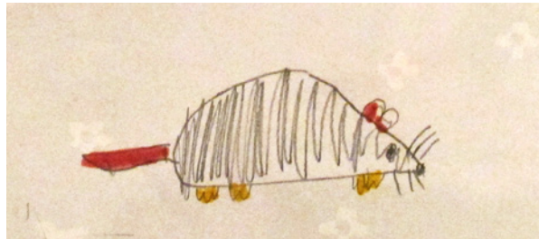
My character 'Cheese'