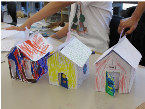
The fun houses we made