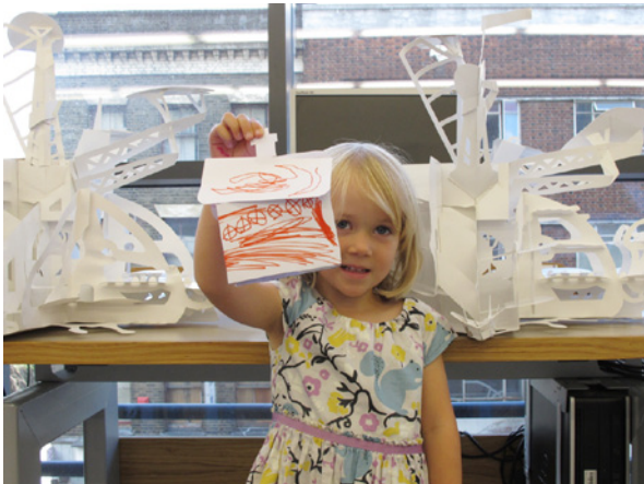
My sister and her pop-up house

Dalston Children's Festival dalstonchildren.org facebook.com/dalstonchildren @dalstonchildren