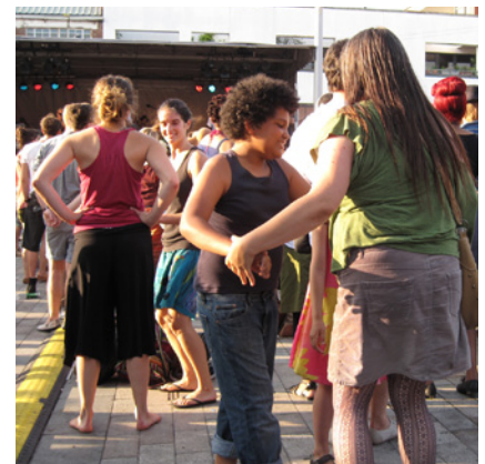
Dancing on Gillett Square