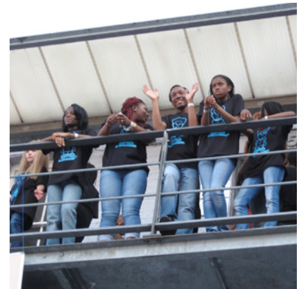
Boy Blue waiting to perform