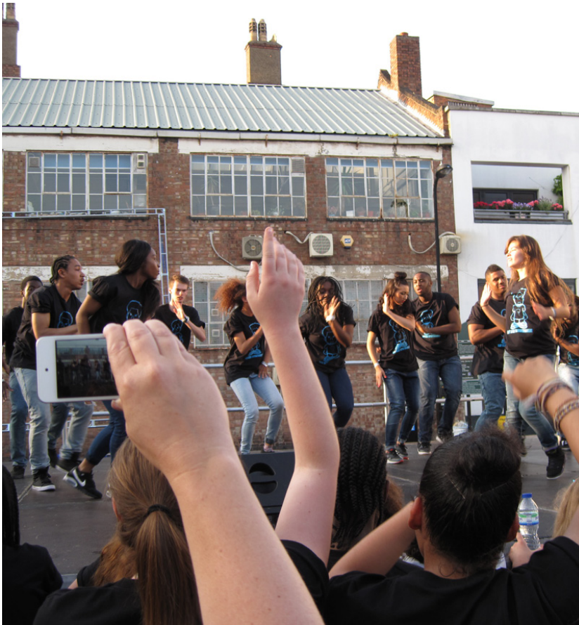
Wicked dance routine by Boy Blue

Dalston Children's Festival dalstonchildren.org facebook.com/dalstonchildren @dalstonchildren